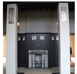
Charles Rennie Mackintosh House for an art lover July 2016