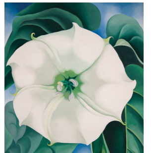
Georgia O'Keeffe Tate Modern August 2016