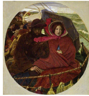
Pictures from Sister Wendy's Odyssey: The Last of England Ford Maddox Brown Fitzwilliam February 2016