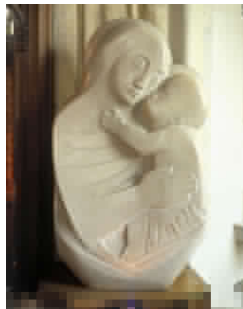
Barbara Hepworth Tate Britain August 2015