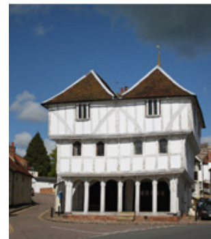
Thaxted Guildhall June 2016