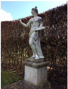
Anglesey Abbey April 2016