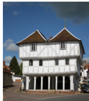
Thaxted Guildhall June 2016