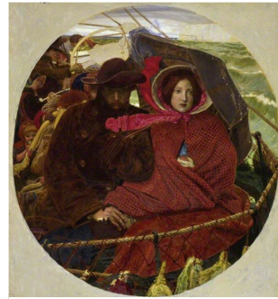
Pictures from Sister Wendy's Odyssey: The Last of England Ford Madox Brown Fitzwilliam February 2016