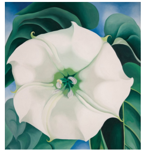
Georgia O'Keeffe Tate Modern August 2016