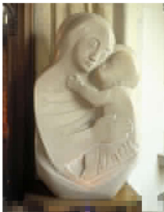
Barbara Hepworth Tate Britain August 2015