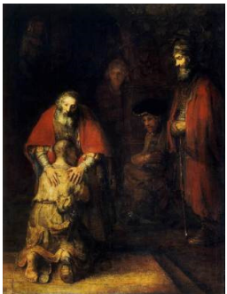
Rembrandt - The Return of the Prodigal Son January 2016