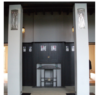
Charles Rennie Mackintosh House for an art lover July 2016